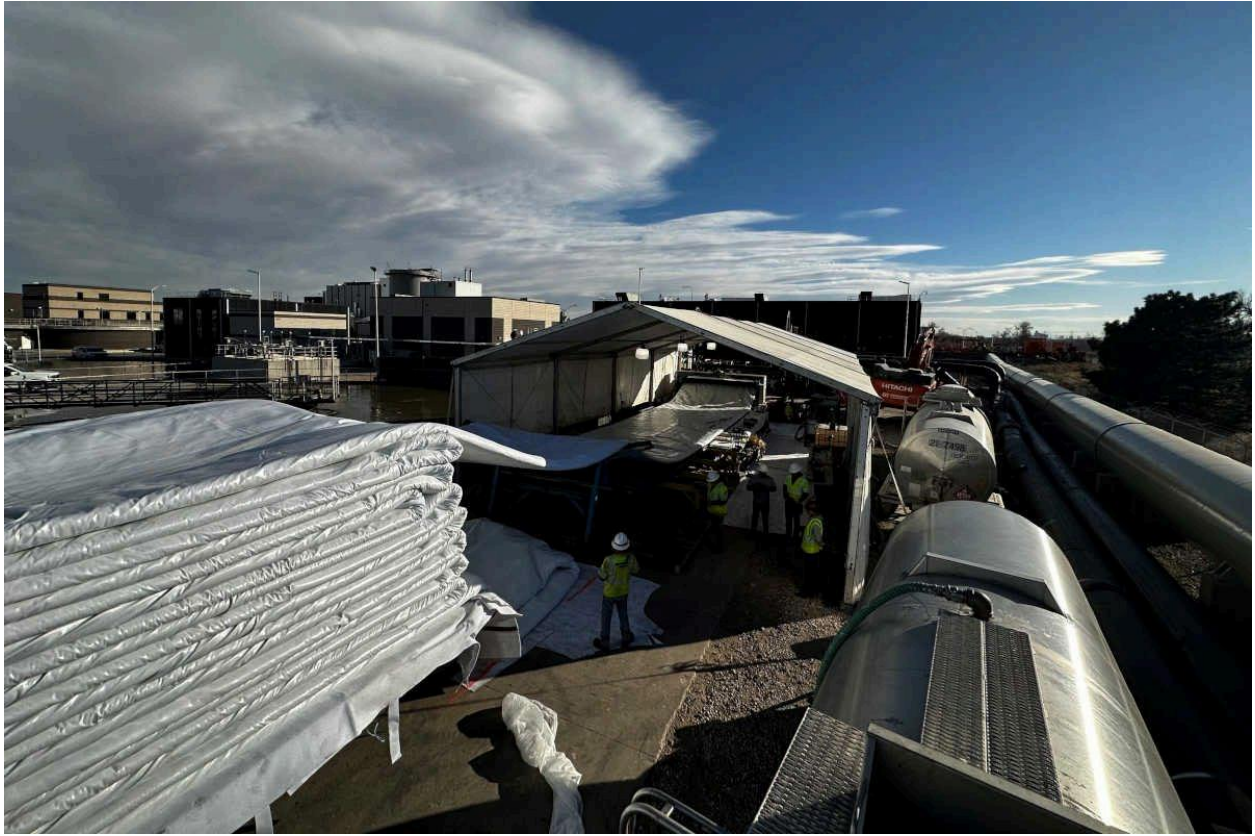
Robert W. Hite Treatment Facility in 2023. Trenchless technology.