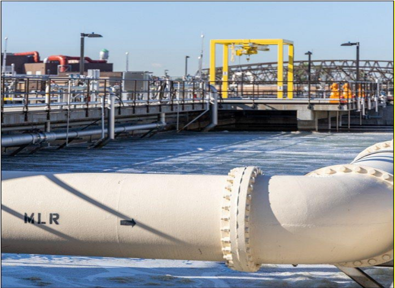
Northern Treatment Plant Bioreactor, taken in 2023.