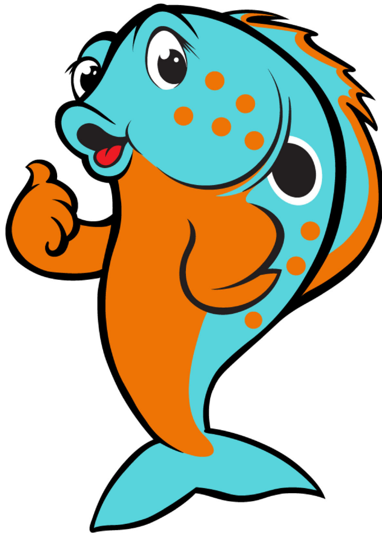
Metro's education mascot "Fin" – an orange-spotted sunfish